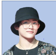
No hats or sunglasses